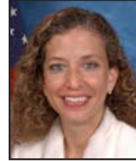
U.S. Rep. Debbie Wasserman Schultz