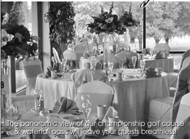
The panoramic view of our championship golf course & waterfall oasis will leave your guests breathless!